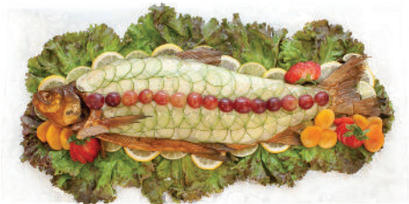
Whole Smoked Lake Trout $19.99 lb avg weight 3-5 lbs