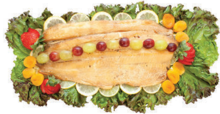
Smoked Whitefish Fillet $17.99 lb avg weight .75 - 1.25 lbs