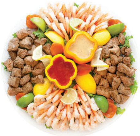
Smoked Salmon Nuggets & Jumbo Shrimp Platter 25 ct / 1 lb $65