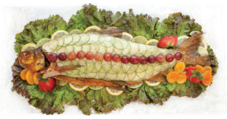
Whole Smoked Lake Trout $19.99 lb avg weight 3-5 lbs