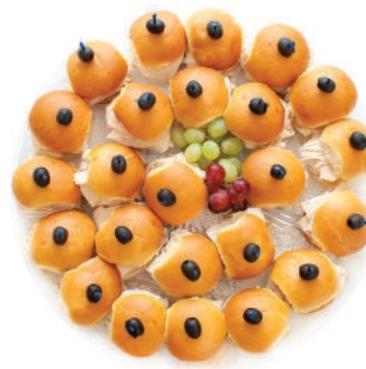
Cocktail Sandwiches with Condiments On The Side Ham, Turkey or Beef Egg, Chicken or Tuna Salad Upgrade to Beef or Pork Tenderloin Add Cheese or upgrade to Mini Croissants