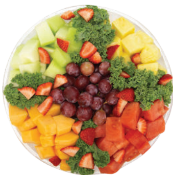
Signature Fruit Tray 12" $44, 16" $54, 18" $72