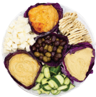
Mediterranean Hummus Tray 16" $64, 18" $79