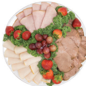
Premium Deli Meat Tray 12" $65, 16" $89, 18" $109