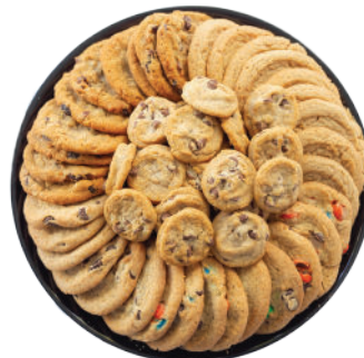
Sendik's Cookie Tray 20 ct $20, 40 ct $40.