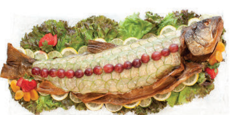
Whole Smoked Whitefish $16.99 lb avg weight 3-5 lbs

Ask one of our associates to help you create a custom order.