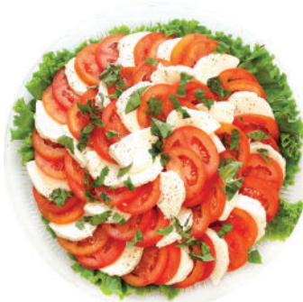
Capri Tray 12" $39