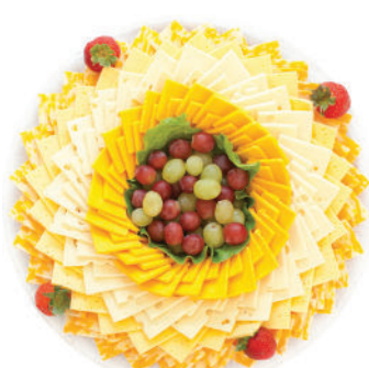
Classic Deli Cheese Tray with Wellington Crackers 12" $62, 16" $82, 18" $109