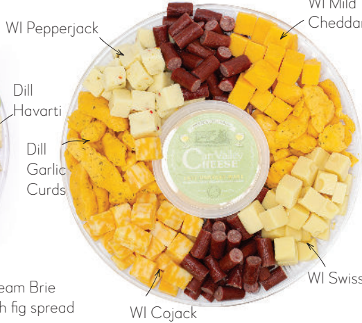
Wisconsin Classics Cheese Tray