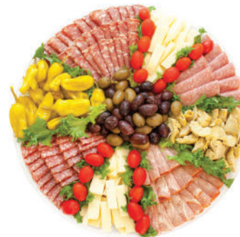
Antipasto Meat Tray 16" $72, 18" $99