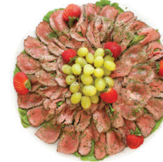
Tenderloin Tray 12" $69, 16" $99, 18" $119