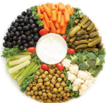
Vegetable & Relish Tray with Dip 12" $39, 16" $54 with dill or ranch dip