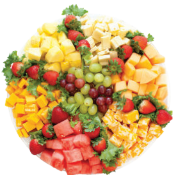
Fancy Fruit & Cheese Tray 12" $49, 16" $69, 18" $89