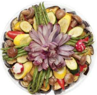
Roasted Fresh Vegetable Tray 16" $69