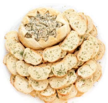
Stuffed Bread Bowl 12" $42, 16" $65, 18" $75 Choose from: Spinach or Crab Cracker Dip