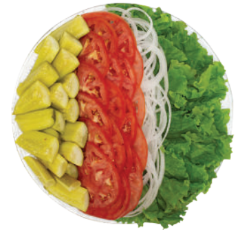
Top-It-Off Tray 12" $25, 16" $34, 18" $42