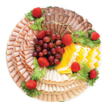
Deluxe Deli Meat & Cheese Tray 12" $69, 16" $92, 18" $109