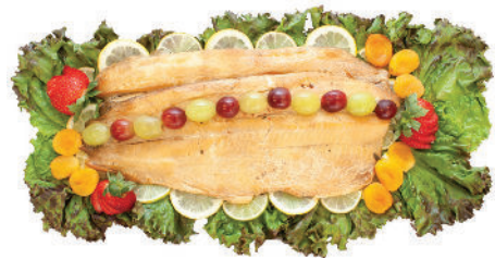
Smoked Whitefish Fillet $17.99 lb avg weight .75 - 1.25 lbs